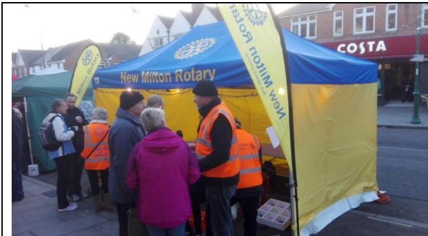
Have a mulled wine if you're cold

The next scene is Station Road, New Milton, a muddle of vehicles dispensing gazebos, tables, items for display, the odd dog and many confused stall-holders. But not the Rotary team, a well-drilled company debussed from their vehicles; the gazebo popped up complete with canvas covering and facing the correct way, tables were erected and once the generator was fired up Christmas themed music resonated all around and brought good will to all those trying to get ready for the throngs of local residents expected to take advantage of the free-parking and if rumour was true mulled wine and mince pies at the Rotary Stall.