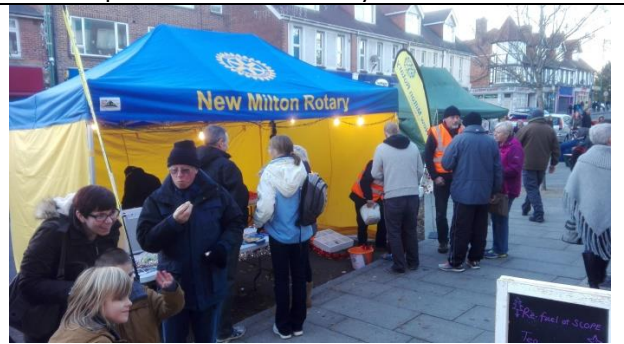
Get your mince pies here

A steady stream of people visited the Rotary Stall, some for mince pies, some for mulled wine and some who were interested in Rotary International and its work. All this kept the team very busy: talking to potential members; replenishing stocks of mince pies; and, Debbie going back home to brew up more mulled wine. A busy day – but nevertheless a rewarding one as we were able to distribute good cheer to the people of New Milton.